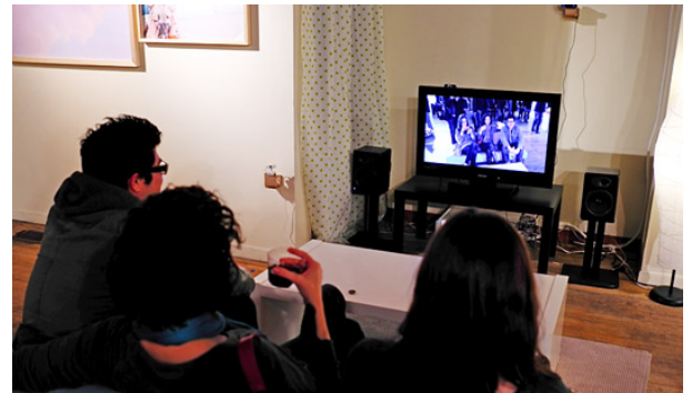
Installed at Co-Prosperity Sphere, Chicago, IL

The next installation at SpaceCamp titled Speed of Reality explores these questions. It presents the viewer with a living room environment where they can sit and watch themselves on the HD television. They see themselves in the style of reality TV, with constantly changing camera angles that zoom and pan on the subject. The music shifts rapidly, changing the mood. Is "reality" media altering non-mediated reality?