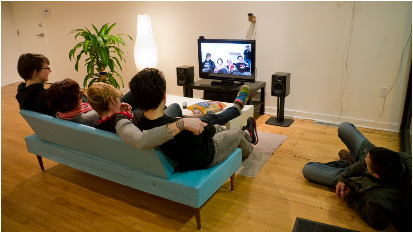
Speed of Reality 2010